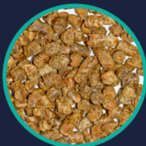
Dried citrus pulp pellets