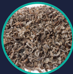
Sugar beet pulp