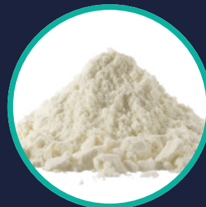
Skimmed milk powder