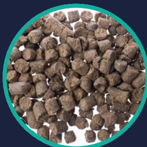
Brewers' grains pellets