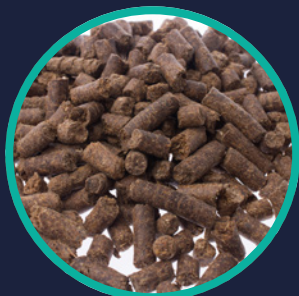
Dried distillers grains