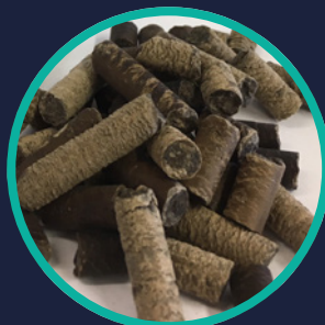
Microbial biomass granules