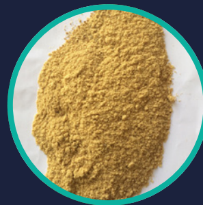
Gelatine process derived proteins