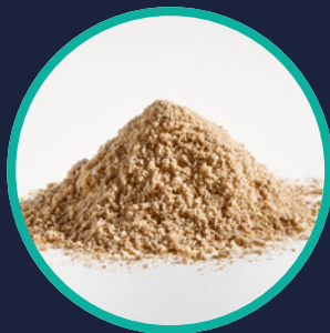
Processed animal protein