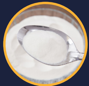
Collagen hydrolysate (collagen peptide)