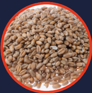
Whole wheat grain