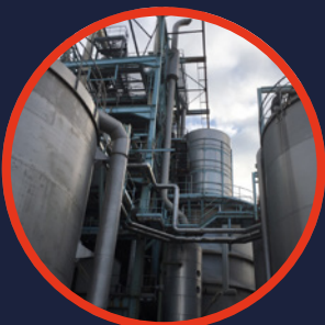
Micro-organisms grown in industrial fermenter