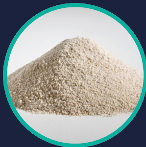
Spray-dried blood plasma