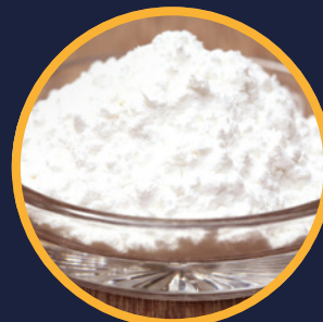
Food and feed additives