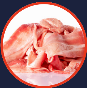
Hides and skins