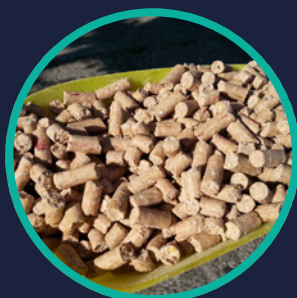
Processed former foodstuffs