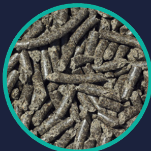
Sunflower oil cake pellets