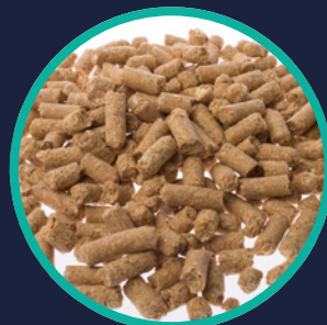
Maize gluten feed pellets